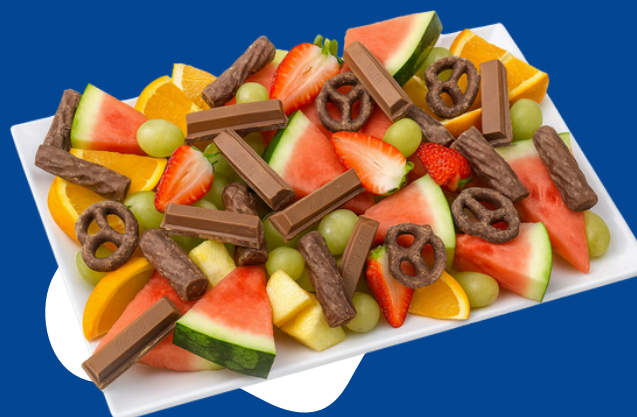
COLD GRAZING BOXES

Option 2: Assorted mini quiches and assorted cocktail pastries