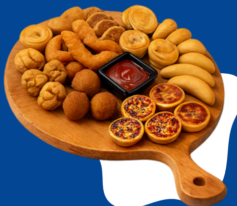
HOT FOOD PLATTERS